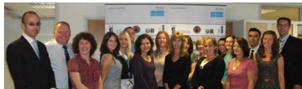
The Trading Standards Team, based at St Mary's House.